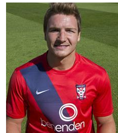
16. Dave WINFIELD